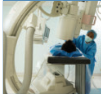
Trust our testing of your equipment to optimize your product application decisions.

Couple these process advancements with our highly proven, highly engineered components and pre-assembled systems, and you've optimized your medical machine project.