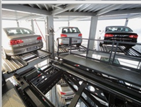
PC Series actuators deliver extended life, high repeatability, and quiet operation. In addition, they require minimal maintenance and resist corrosion in harsh environments.

Thomson now offers its industry leading PC Series precision linear actuators with an optional, pre-mounted and pre-tested Kollmorgen AKM servo motor. Benefit from this bundle with: