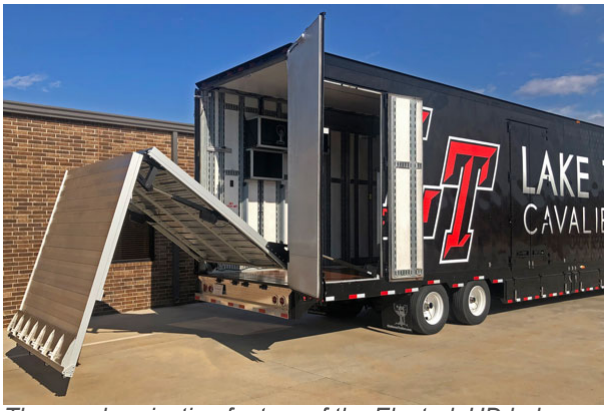
The synchronization feature of the Electrak HD helps coordinate smooth, safe and quick ramp operation.

With millions of dollars of marching band equipment to transport up to 20 times per year, the team at Clubhouse Trailer Company was challenged with maintaining the safety of the equipment as well as those loading and unloading it. A key contributor to their success was making the switch from hydraulic cylinders to Thomson